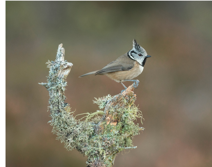
Crested Tit

Meetings held at St Andrews Church Hall, St Andrew St, Brechin, DD9 6JB Tuesdays 7:15pm September to April